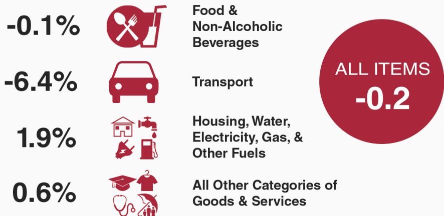
Figure 2: Inflation Rates by Major Categories; January 2019

Prices within the 'Transport' category saw an overall decrease of 6.4 percent for the month of January 2019, when compared to January 2018. This was the main category exerting downward pressure on the overall rate of inflation for the month. The decrease was mainly the result of a sharp decline in international airfares, coupled with a 2.6 percent reduction in the 'Fuel and Lubricants' subcategory. Fuel prices have trended downward for the past several months, after having spiked in January and June of 2018. The average price per gallon of Regular gasoline saw the most significant decrease, dropping by 8.9 percent from $10.29 in January 2018 to $9.38 in January 2019, while Premium gasoline fell by 6.9 percent from $11.45 to $10.66. The average price per gallon of Diesel was almost unchanged, going up by only 3 cents from $10.00 in January 2018 to $10.03 in January 2019 (see Table 1).