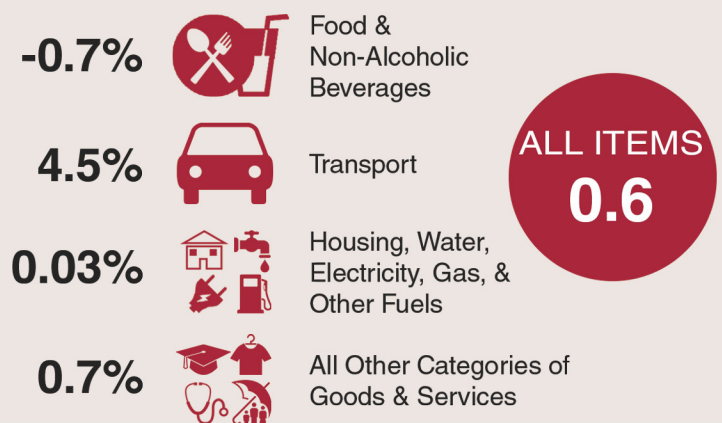
Figure 2: Inflation Rates by Major Categories; June 2018