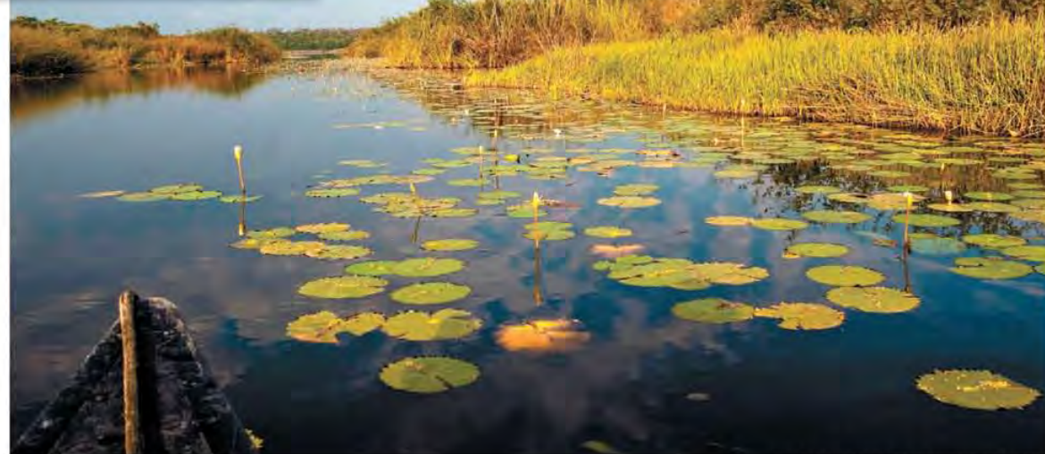
Belize's Crab-Catcher Lagoon is a haven for more than 400 species of birds, including the nearly extinct harpy eagle.

The clean water and lush greenery in this area provides the perfect habitats for more than 400 types of bird and I easily spotted exotic species. Up on a thick tree branch perched a black-collared hawk with its distinctive rust and black coloring. Ospreys circled over head while limp-