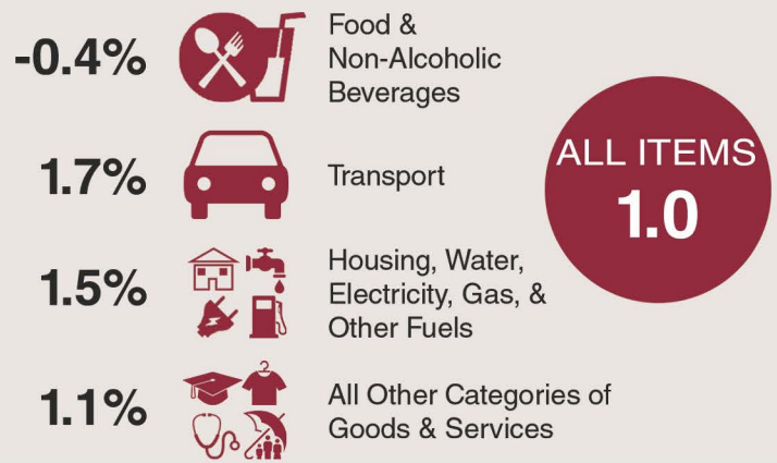
Figure 2: Inflation Rates by Major Categories; September 2018