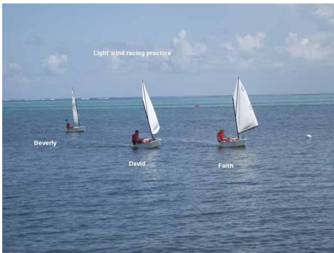
Sailing lessons and