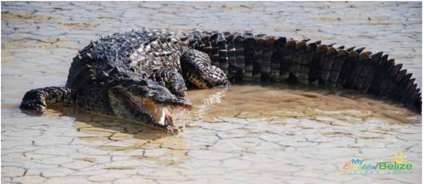
figure it has to be ok to go on the property since this is a known spot for birds and crocodiles. As you head to the waters edge, the crocodiles seem curious. You are excited to get close and personal with these apex predators, and the crocs are getting closer, and closer, and THEN...