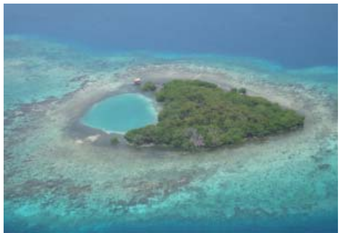
From an aerial view, quaint, small islands take on an even more impressive beauty, and one can truly appreciate the wonders of nature.

Gustavo Jr. emphasized that safety and professionalism is their number one priority. Their Bell 206 B3 Jet Ranger helicopter is a world renowned turbine powered rotary wing aircraft and is considered to be