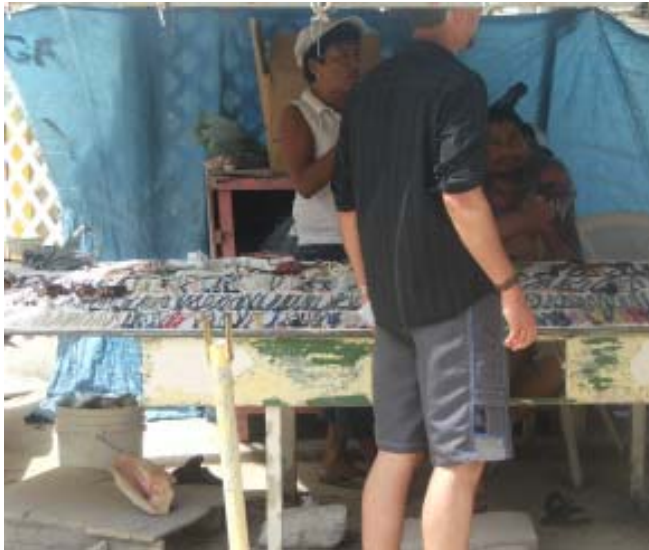
At Central Park, vendors line up to sell you the best in hand crafted jewelry; necklaces, bracelets, anklets line up the various stalls. You can find among them wood carvings, sea shells, and other special knickknacks.

So, follow us through our stroll around the various stores in San Pedro Town as we present to you our newest series, A San Pedro Shopping Experience. Remember, if all else fails, there's no shortage of San Pedro T-Shirts!