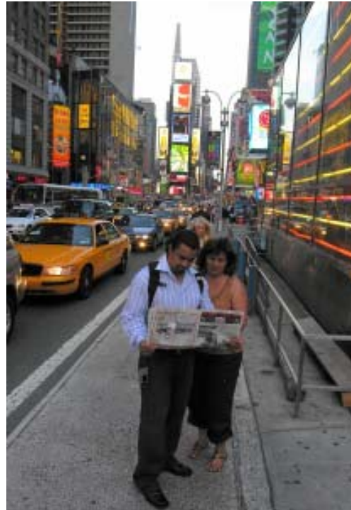
The couple decided to enjoy some more San Pedro news while in Times Square as well!

Photos taken in unique and unusual places are preferred. Be sure to identify who is in the photo and where the photo was taken. Don't forget to include your names and what you were doing.