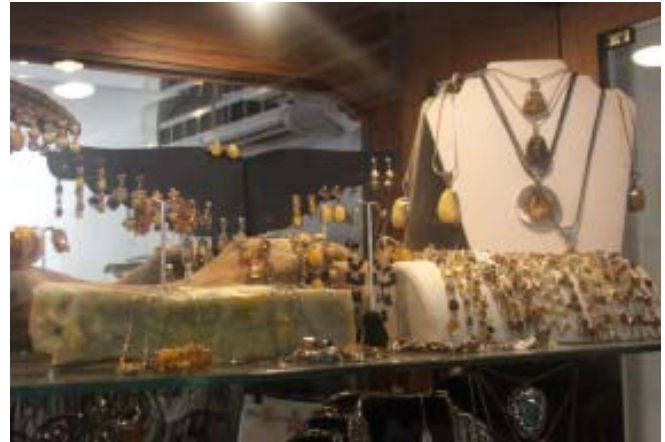
Mambo Chill has exquisite jewelry, beautiful sandals and glorious sundresses. Visit them today to purchase a special gift for that special someone or just come in and pamper yourself.