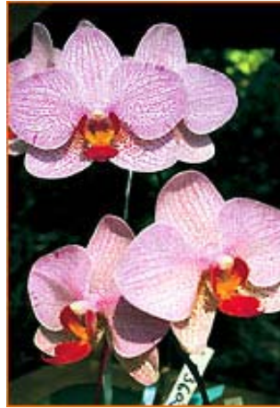
Enjoy the gorgeous view of the lake, and be sure to wade up to Orchid Island for a breathtaking view of the lovely orchids in bloom!

on the eastern edge of the lake will allow you to wade to a small, forested spot of land that grows a profusion of wild orchids, aptly named Orchid Island.