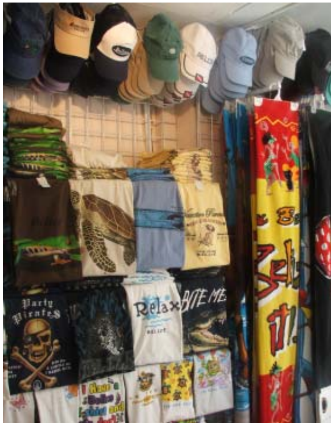
At Island Vibes, one can find a wide array of souvenirs to choose from. Take a shirt, towel, cap, mug, shot glass, or even samples of the fine Belizean liquor back home. They also have a wide array of women's apparel should in case you need a new dress, blouse, skirt or even shoes.