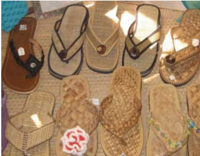
Step out in style with lovely sandals courtesy of Mambo Chill Boutique...be sure to check out the wide array of shoes and clothing available for every occasion!