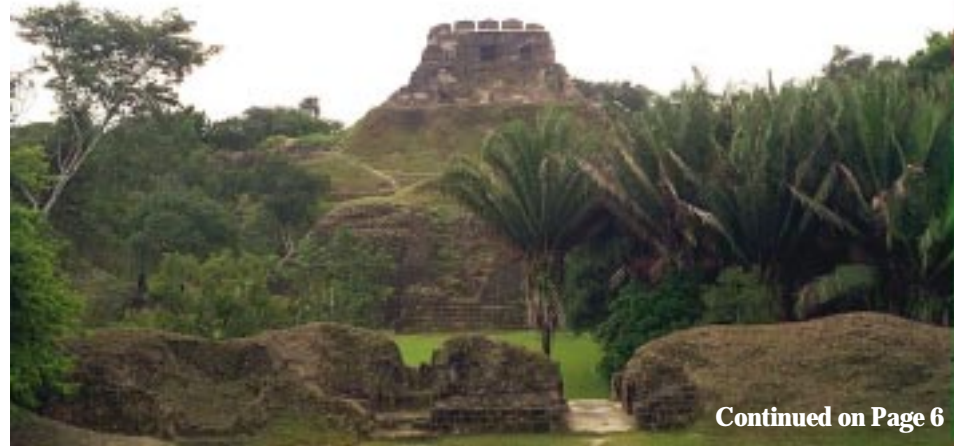
Continued on Page 6