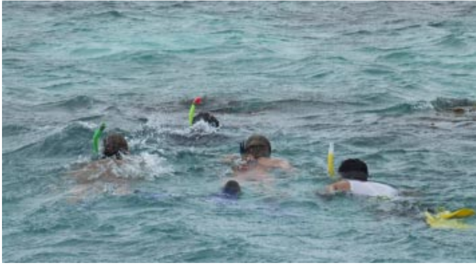
Snorkeling is at its best in Belize.

km) offshore from Ambergris Caye. Much of it is totally unexplored and all of it is easily accessible by boat. The reef is like a gigantic wall running parallel to the coast. Between the mainland and the reef are shallow, sandy waters with numerous mangrove-covered islands (cayes).