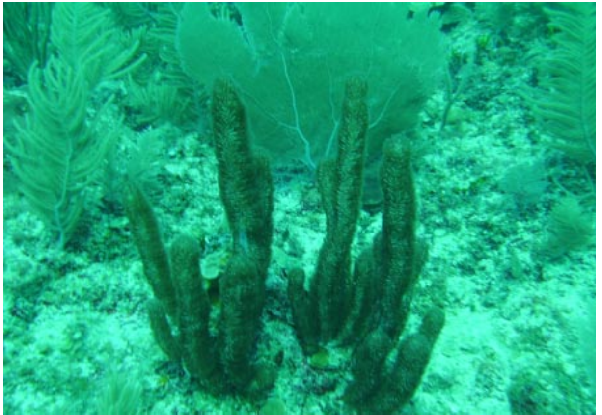
Coral of all shapes and sizes fascinate the divers.

we control our descent, dropping 20 feet into a narrow cavern. We ease down the narrow passageway as thin beams of light from above guide our way through this fascinating underwater maze. A large sea crab is among the many interesting creatures that call this cavern home.