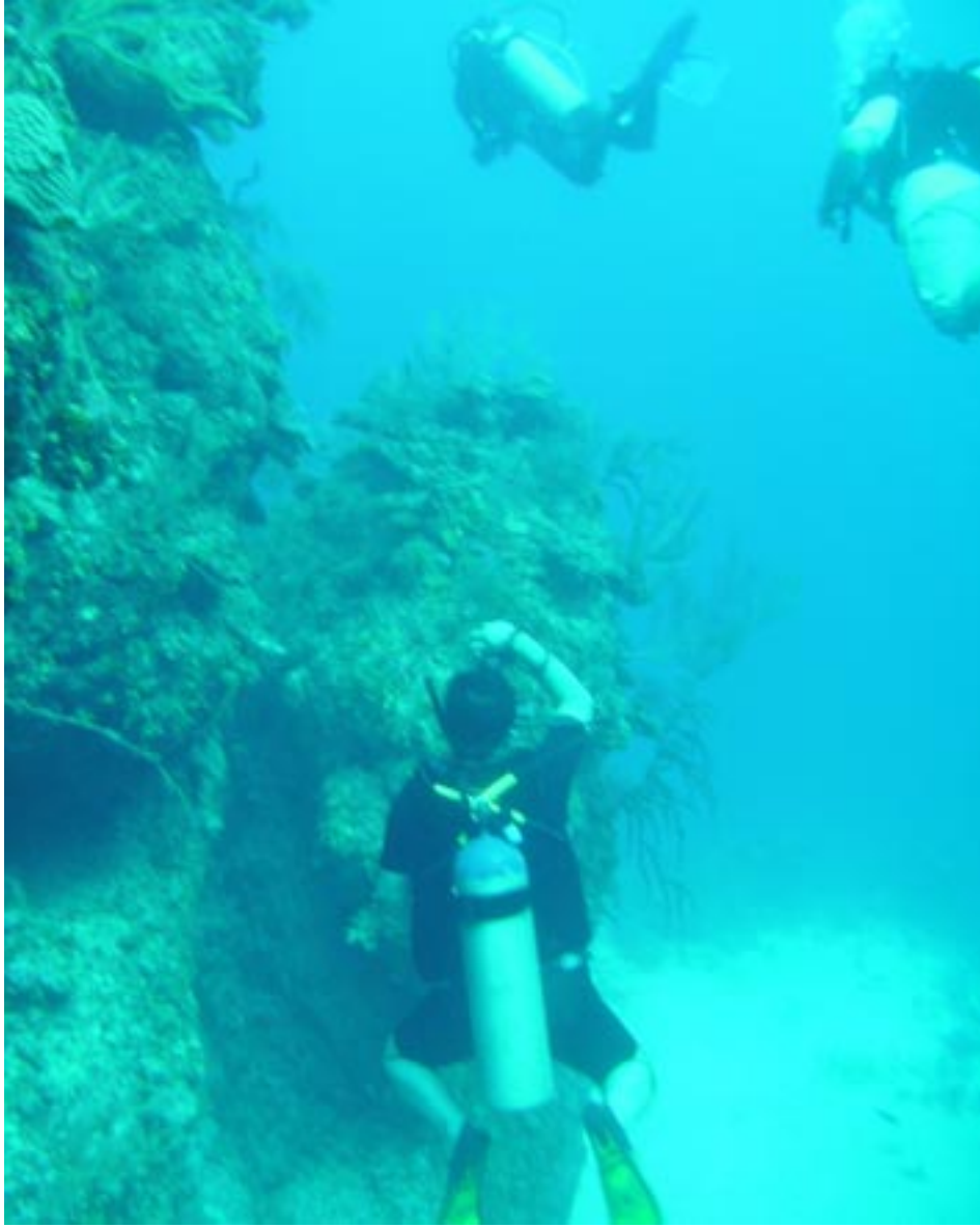
Once out of the crevasse, walls of coral are awaiting us to explore.

cave opens to reveal the rolling coral reef. Here, we turn north with the vast abyss to our right and the rolling caverns of coral reef to our left. Fish become more abundant as we gradually ascend. Then after about a 40 minute tour, it's time to ascend to the surface. We do our safety stop for three minutes, and then float to the surface. The