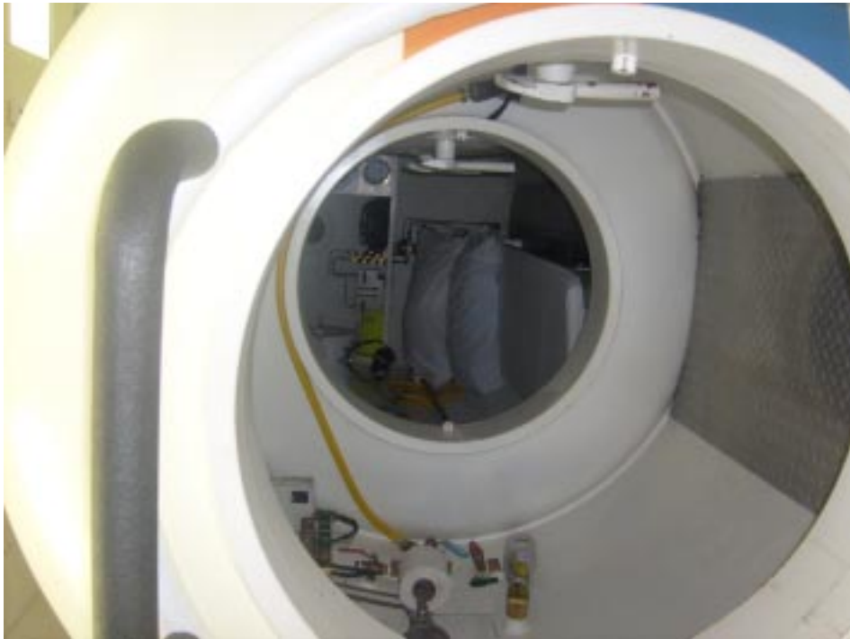
A fully equipped Hyperbaric Chamber is key for divers in San Pedro.

in Belize, San Pedro is home to the only Double-Lock Recompression Chamber in the country which is the only method for treating these afflic-