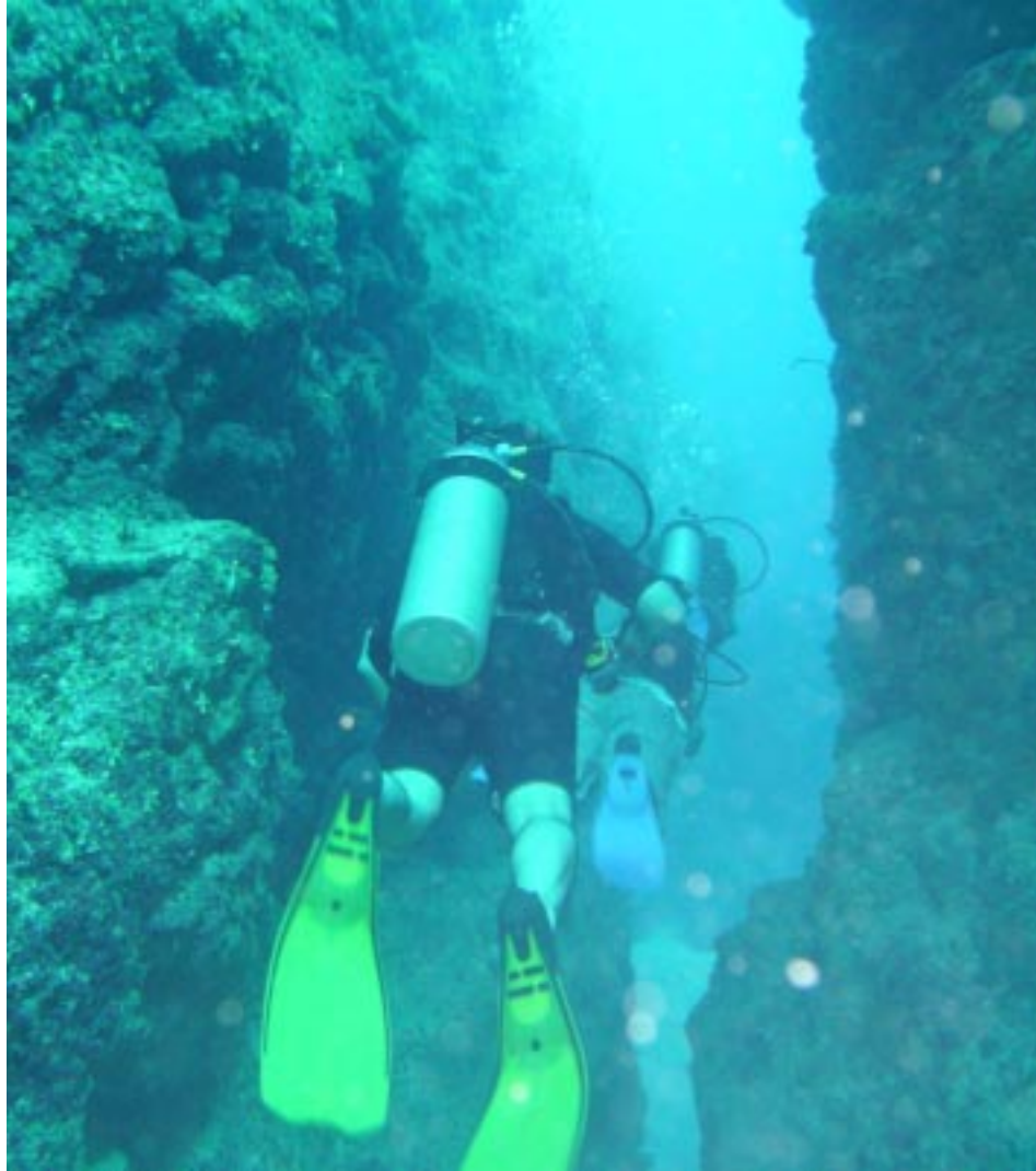
The steep walls of this crevasse provide a maze-type feeling to this dive site.

San Pedro boasts some of the best diving in the world. Visitors marvel at the sights that are available just minutes from the shore of Ambergris Caye. The San Pedro Sun Visitor Guide continues to explore these wondrous destinations and share our experiences with our readers.