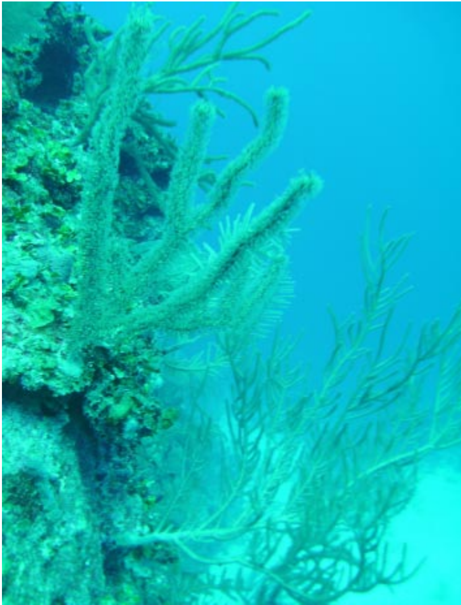
Coral cover the many canyons and crevasses that make up the barrier reef.