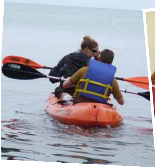
Paradise Resort: The place to stay at Placencia. Enjoy an idyllic, relaxed getaway.